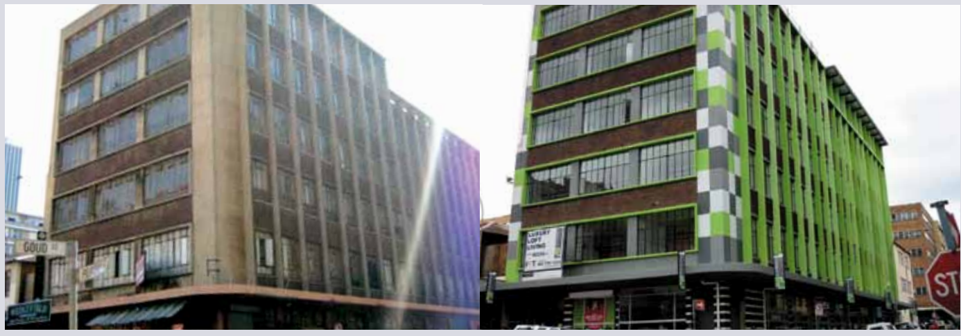
Avon House before