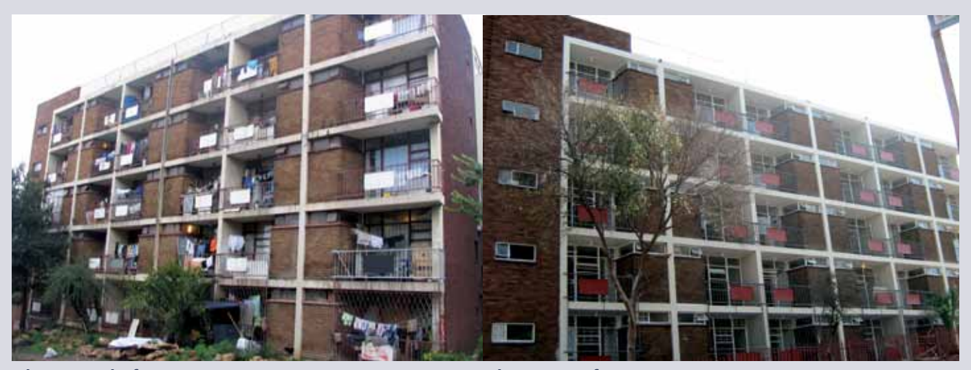
Als Towers before