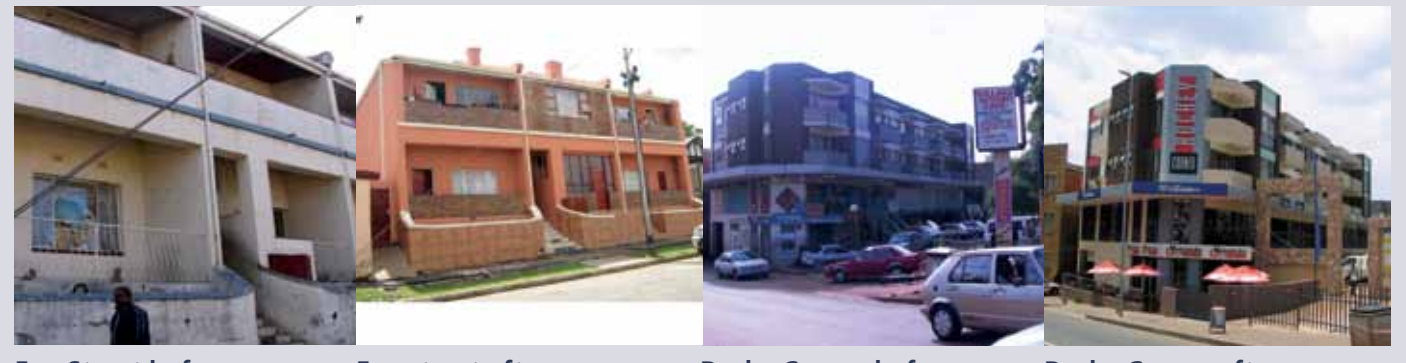
Fox Street before