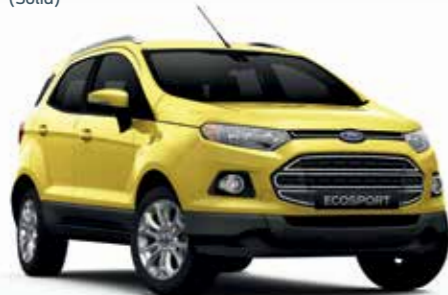
Bright Yellow (Solid)