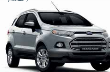
Moondust Silver (Metallic*)