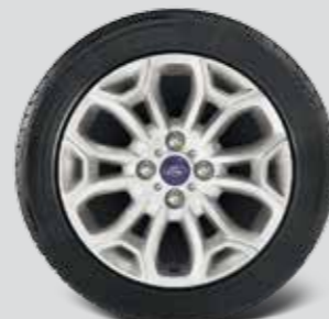
16" Alloy wheel 205/60/R16 Standard on Titanium