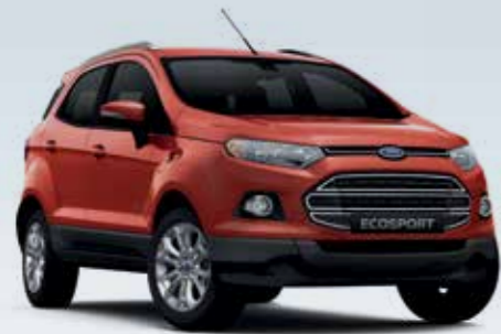
Mars Red (Metallic*)

Colour your world – brighten your future with an exciting range of trendsetting ECOSPORT colours. |