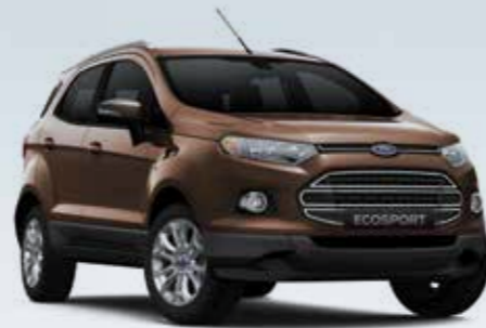
Golden Bronze (Metallic*)