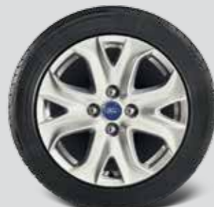
16" Alloy wheel 205/60/R16 Standard on Trend