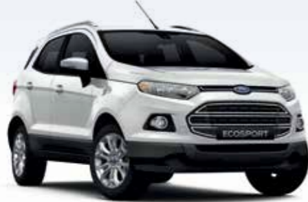
Diamond White (Solid)