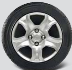
15" Steel wheel with styled cover 195/65/R15 Standard on Ambiente