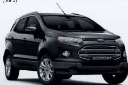
Panther Black (Metallic*)