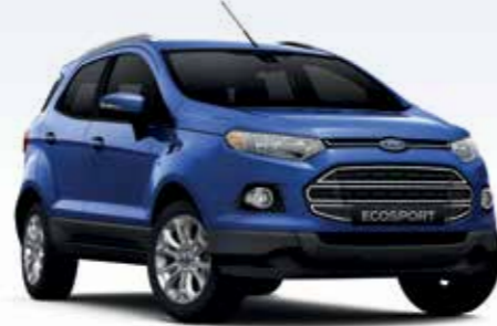
Kinetic Blue (Metallic*)