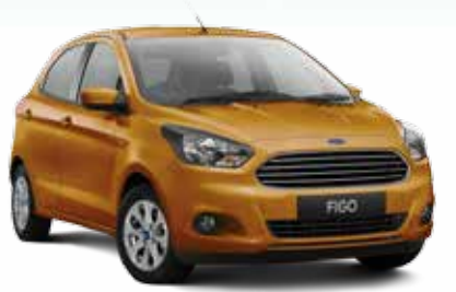
Korea Gold (Pearlescent*)