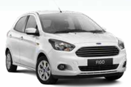
Oxford White (Solid)