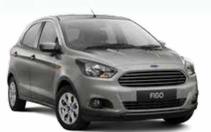
Ingot Silver (Metallic*)