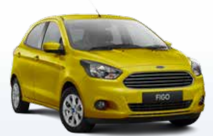
<sup>o</sup>Bright Yellow (Metallic*)

*Metallic and Pearlescent body colours are options at extra cost. °Bright Yellow available on Hatch only.