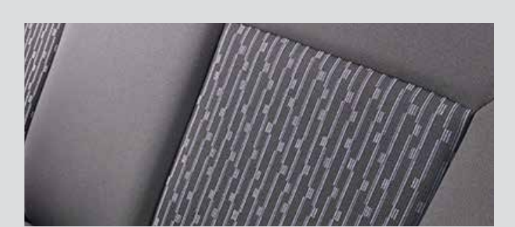
Hatch and Sedan Titanium trim.