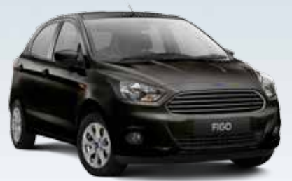
Tuxedo Black (Solid)