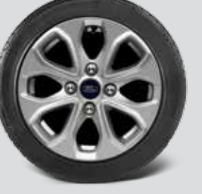
14" Alloy wheels - 175/65/R14. Available on Trend and Titanium only.