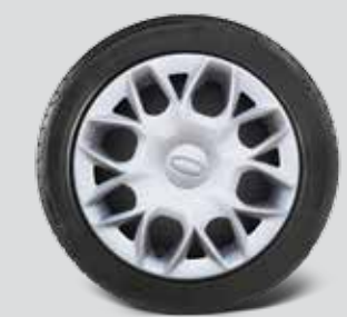
14" Steel wheels - 175/65/R14. Available on Ambiente.

Purpose-designed to compliment the all-new FIGO .