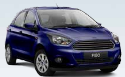
Deep Impact Blue (Metallic*)